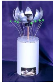
Figure 5: Mateas and Böhlen's Office Plant #1

form of a high-tech plant that responds to the emotional and social tenor of its owners' incoming email stream. The device filters the users' email into social and emotional categories such as "chatty" or "FYI," with the resulting categories driving subtle and very slow changes in the plant's shape: the petals move in and out, the fronds wave, etc. Office Plant #1 clearly has an interpretation of the user's email, but this interpretation is not a straightforward status monitor of the presence or emotional quality of that email. It is presented indirectly and in an alien form that requires interpretation. By presenting their interpretations in defamiliarized ways, such systems provide opportunities for reflection on and reinterpretation of the context which users and systems share, but see in different ways.