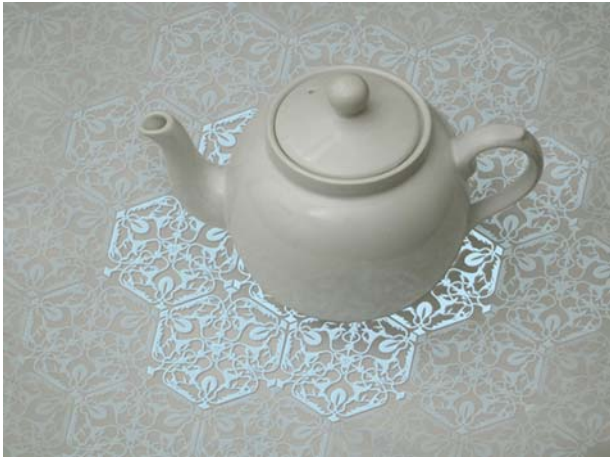
Figure 2: The History Tablecloth

highlighting how long objects have stood on it [19]. If an object remains in place, over time the tablecloth slowly begins to glow underneath it (Figure 2). The Tablecloth suggests that whether objects are stationary or moving may be interesting to think about. It does not, however, suggest what the implications of this might be: whether it is good for objects to remain in place or move, or what the flow of objects in a home say about its inhabitants' lifestyle or values. These implications are left to its users to decide.